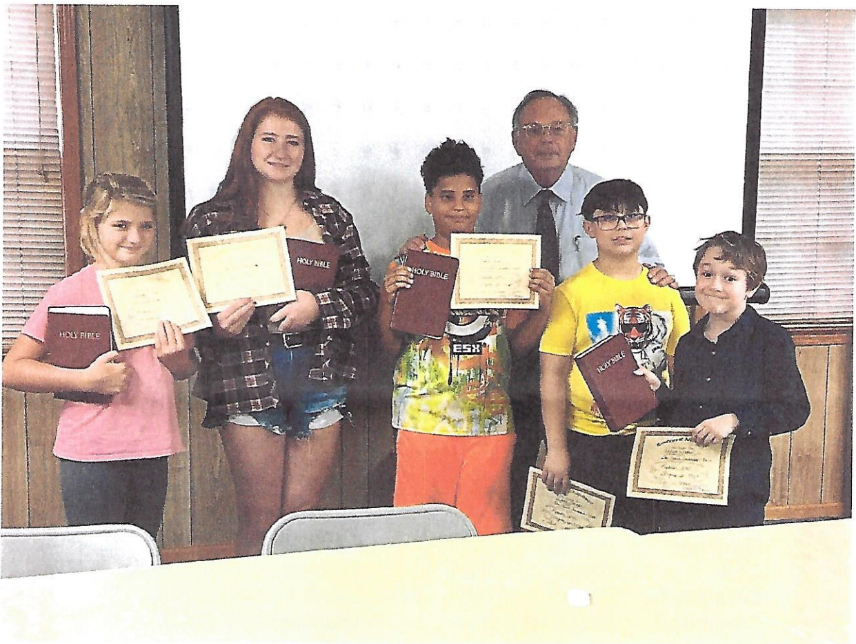
The Youth Formation class finished up in October. Everyone that participated received a certificate and a new Bible.