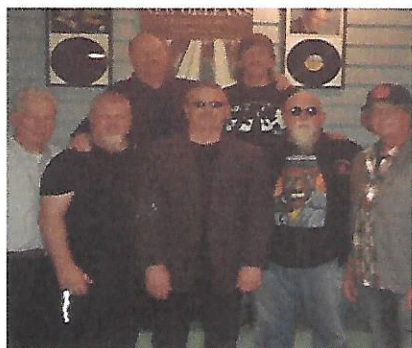
Crusty Veterans Band

Come to the church lawn and listen to Some 60's, 70's, & 80's classic rock Music on Friday Sept. 9th 2022 6:30-9:30 pm be sure to bring lawn Chairs. There will be a food truck Serving hamburgers & hot dogs!