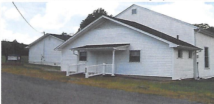
Kedron United Methodist Church Homecoming Sept. 18th 2022

You are welcome to come and celebrate Homecoming 2022 with us at Kedron United Methodist Church on Sunday September 18th 2022 at 11:00 am with fellowship lunch after. Please note time change for service