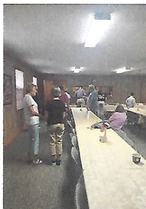
Fellowship supper August 2022